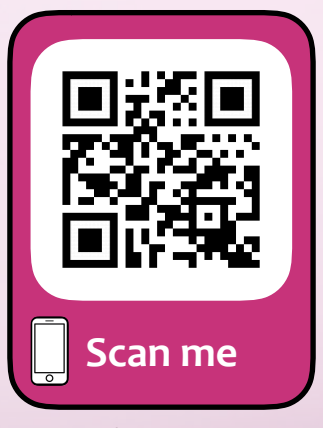
Full version of the Academic Handbook

Published by: School of Industrial Technology, Universiti Sains Malaysia