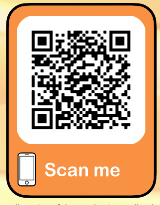
Full version of the Academic Handbook

Published by: School of Industrial Technology, Universiti Sains Malaysia