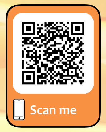
Full version of the Academic Handbook

Published by: School of Industrial Technology, Universiti Sains Malaysia